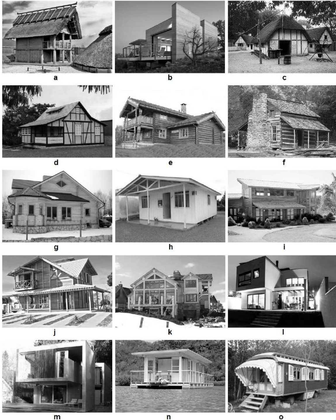
Fig. 1. Wooden housing techniques: (a) hut in mocambo hut (Adams 2005), (b) house in rammed earth (Construction Zone 2008), (c) wattle and daub home (Rowan 2012), (d) half-timbered frame (Volles 2011), (e) laft hus (Tinnoset Bygg og Laft 2004), (f) log cabin (Farkas 2011), (g) log home (Gratia Grupa 2005), (h) clapboard and wainscot home (Itacasas 2014), (i) double walls of nailed clapboards (Casas Condor 2010), (j) house in horizontal clapboards between studs (Brasil Casas 2012), (k) post-and-beam house (Canada's Log People Inc. 1999), (l) woodframe in platform type (Tecverde 2016), (m) modular home prefabricated with cross laminated timber (Cagnon and Pirvu 2011), (n) houseboat (Boardman 2011), and (o) house on wheels (Burke 2013).